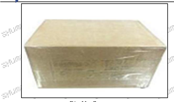
Pic No.2 Domestic express packaging: Wrapped by Transparent tape